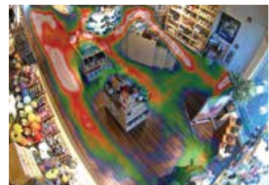
Visual Insights (Heatmaps)