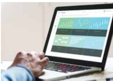
Detailed/ Personalized Reports