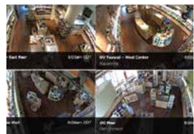
Multiple Sites/ Stores Comparison