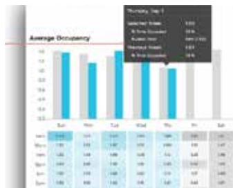
Dwelling / Occupancy Analysis